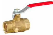
L110T & LNL110T 600 WOG, Full Port, NPT, w/drain