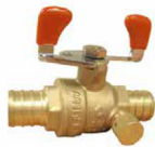
LPB1711W & LNLPB1711W 600 WOG, Full Port, PEX w/ drain