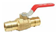
L1907 & LNL1907 600 WOG, Full Port, Propress style