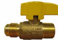
L249T - Flare end x MIP End