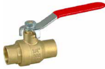
L100C & LNL100C 600 WOG, Full Port, Solder