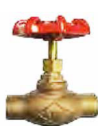
Bronze Globe Valve L112 - Class 150, Solder Ends