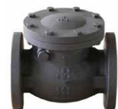
L278-CI-125 Swing Check Valve Class 125, F-F Flanged Ends