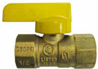
L246T - FIP Ends