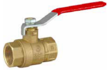
L100T & LNL100T 600 WOG, Full Port, NPT