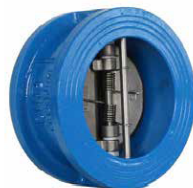
LDC-700E Wafer Check Valve Class 125, Dual Door, EPDM seat