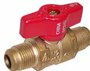
L248T - Flare end x Flare End