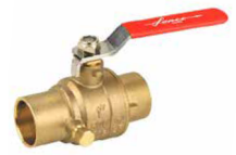
L110C & LNL110C 600 WOG, Full Port, Solder, w/ drain