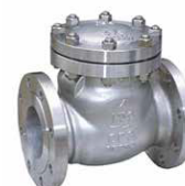
L278-CS-150 Swing Check Valve Class 150, F-F Flanged Ends, bolted cover, 13Cr/HF trim, WCB body & bonnet