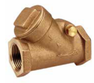
Bronze Swing Check L122T - Class 125, Y-pattern, NPT