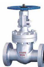
L276-CS-600 Globe Valve, Class 600, F-F Flanged Ends, bolted bonnet, 13Cr/HF trim, WCB body & bonnet