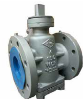
L282-CS-150 Balancing Plug Valve Class 150, F-F Flanged Ends, bolted bonnet, 13Cr/HF Trim, WCB body & bonnet