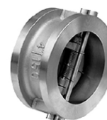
LDC-750C Wafer Check Valve Class 150, Dual Door