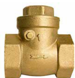
Brass Swing Check Valve L150T - 200 WOG, NPT, T-pattern