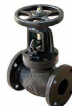
L276-CI-125 Globe Valve Class 125, F-F Flanged Ends