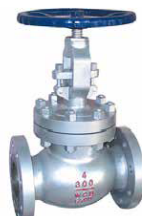
L276-CS-300 Globe Valve Class 300, F-F Flanged Ends, bolted bonnet, 13Cr/HF trim, WCB body & bonnet