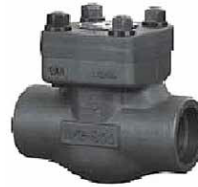
LFPC-810T/LFPC-810S Piston Check Valve, Class 800, Bolted Cover, NPT or Socket Weld Ends