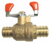
LPB170W & LNLPB170W 400 WOG, Full Port, PEX Ends