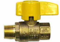
L250T - MIP End x FIP End