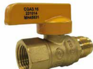
L247 - Flare end x FIP End