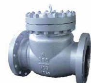
L278-CS-300 Swing Check Valve Class 300, F-F Flanged Ends, bolted cover, 13Cr/HF trim, WCB body & bonnet