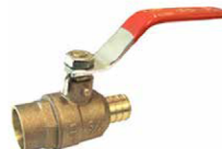
LPF180 400 WOG, Red Port, PEX x Solder